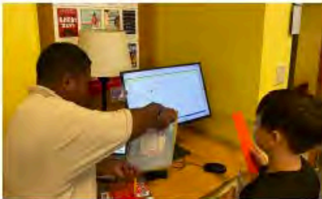
Helping one another.

No need to sign up! All HMS Readers are warmly invited to participate.