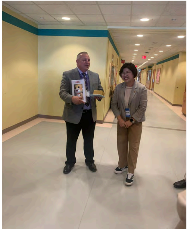
Gyeonggi-do Education Council visited Humphreys Middle School on Monday 9th, 2024